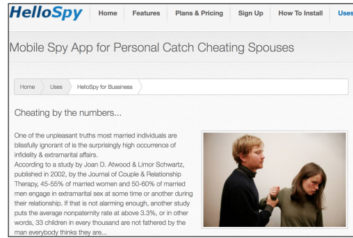
Fig. 1: Screenshot of the HelloSpy website promoting intimate partner violence [35].

store apps). While this labeling may be appropriate for other contexts, for IPV victims these tools are far too conservative. The tools do better detecting off-store spyware, but still fail to label some dangerous apps.